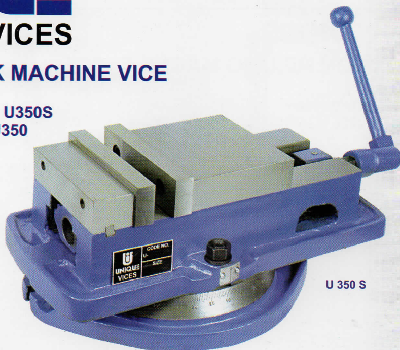
U 350 S